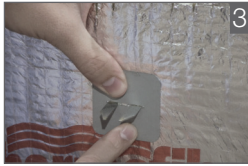
A locking washer is slid over the hanger to fit tightly against the insulation panel.