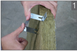
The Impasse hanger is impaled into the insulation. The forked leg provides quick, easy installation.