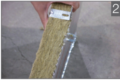
The forked leg of the hanger provides a shelf-like ledge to support the insulation.