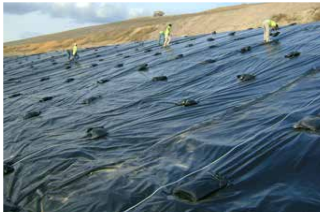
Temporary Rain Shed Cover

DURA♦SKRIM® 8BB, 8WB, are available in a variety of widths up to 125,000 square feet and up to 80,000 square feet in 12BB and 12WB. All panels are accordion folded and tightly rolled on a heavy-duty core for ease of handling and time-saving installation.