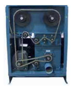
Clear Acrylic Safety Guard Allows for Inspection