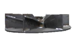
industry standard impeller

Honda’s V-Twin delivers over 21 net horsepower (note: all other motor manufacturer’s use gross HP which is running engine w/out muffler and air filter – not realistic. Effective gross HP is appx 25-26HP) outperforming most to all vacuum motors used today. Variable Timing Digital Ignition--HONDA exclusive--provides optimal ignition timing based on engine speed to deliver consistent power under load, excellent starting, smooth operation, and reduced fuel consumption with outstanding emissions performance.