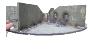
VORTEC Beast impeller