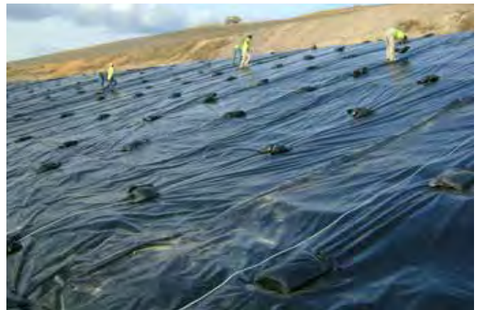
Temporary Rain Shed Cover