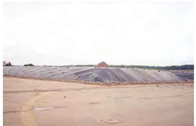
Construction Site Covers