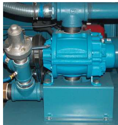
Positive Displacement Blower

w/engine controls, pressure gauge and air bleed off